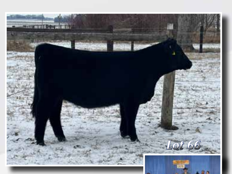
GSJG Impressive Image 1B

Nice patterned structuarly correct purebred female. Exellent disposition female from our impressive cow family. Grandam was many time champion at regionals, nationals, KC and Louisville.